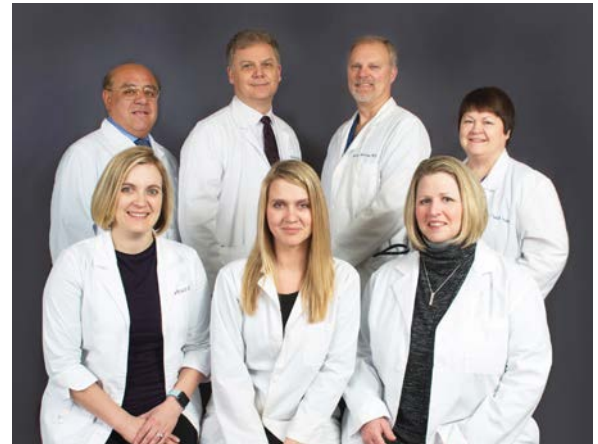
The Regional Health Partners Team